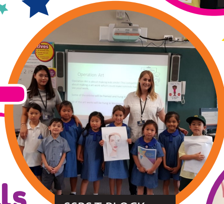
SSPS T-BLOCK Friday ART CLASS