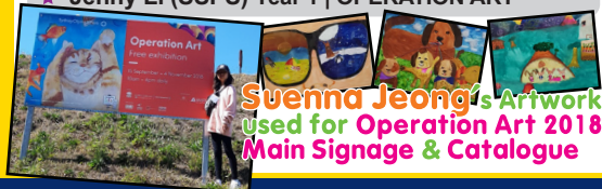
Swenna Jeong's Artwork used for Operation Art 2018 Main Signage & Catalogue